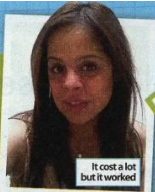
It cost a lot but it worked

In total I spent £600 on laser treatments and creams, but six months on I'm a lot happier. The yellow's gone and my nails are pink and natural-looking. I'm confident about my hands again.