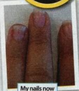
My nails now